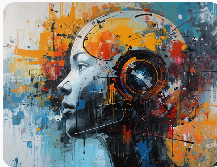
Disclosure: Image created with Canva AI Generator with a prompt "AI"

A related tension point is transparency versus proprietary systems . Many AI tools operate on closed architectures that resist independent audit. Institutions that adopt mass market models, like ChatGPT or Claude, take on accountability for outputs they cannot fully evaluate. Where possible, preference should be given to systems whose methodologies are documented and whose outputs can be reviewed against known standards, such as custom institutional models.